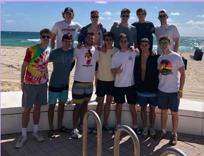
Brothers from Pledge Class 2023 in Fort Lauderdale, Florida