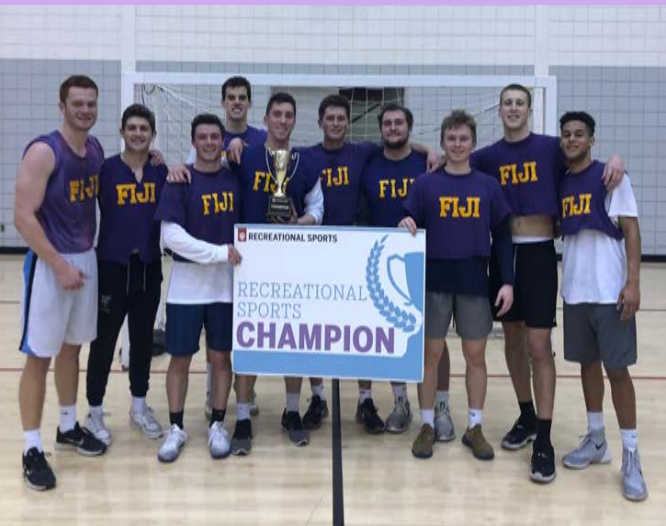
Members of the 2020 Intramural Handball Championship Team